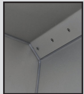
Water tight, sealed, anodised evaporator