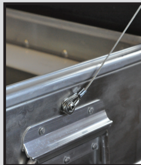
Load-bearing lid lanyard