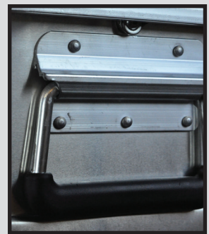
Ergonomic comfort sprung drop handle