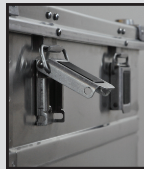
Durable C. fasteners