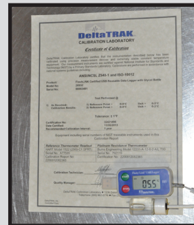
Optional NIST thermometer