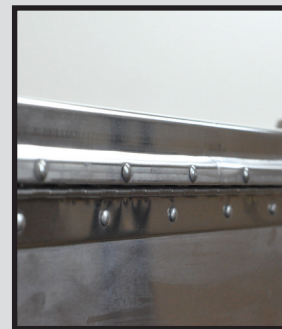
Stainless Steel Hinges