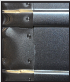
Smooth weldind gap free load-bearing overlap joint