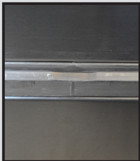
High performance flash butt welding