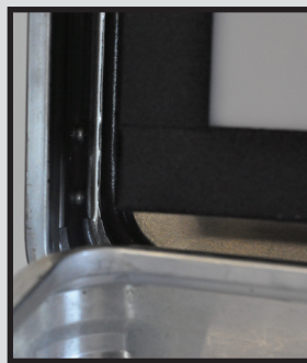
Dual foam seal